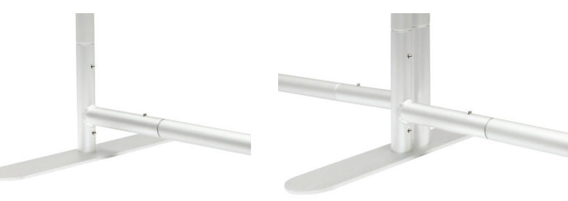
Single foot connection