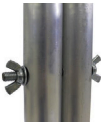
Screw & Wingnut Frame Connection