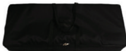
Nylon Carry Bag