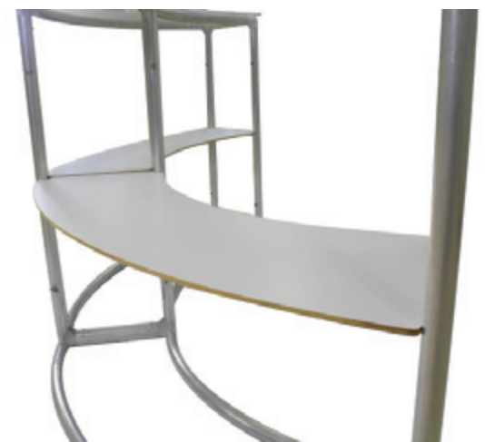
Optional Curved Shelf